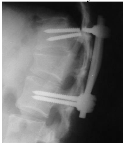
Fig 3: Bilateral broken screws with progressive kyphosis