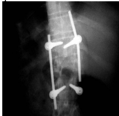
Fig 4: Rod dislodges from the head of the screw