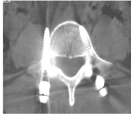
Fig 2: Screw penetrate the lateral side of the pedicle and outside the vertebral body